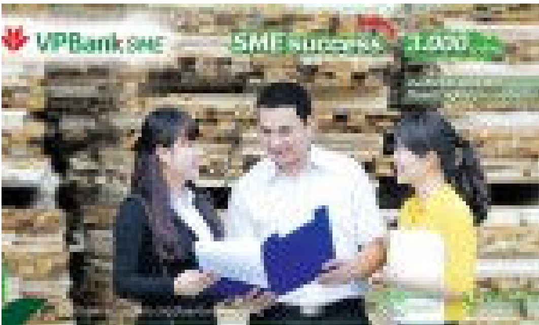
( http://www.dealstreetasia.com/stories/vietnam-ifc-provides-50m-loan-to-vpbank-to-help-small-women-led-cos-52941/ ) Vietnam: IFC provides $50m loan to VPBank to help SMEs, women-led cos ( http://www.dealstreetasia.com/stories/vietnam-ifc-provides-50m-loan-to-vpbank-to-help-small-women-led-cos-52941/ )