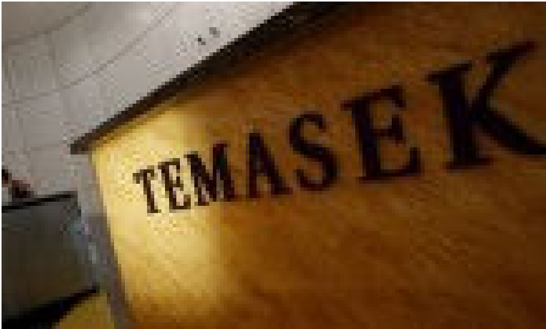
( http://www.dealstreetasia.com/stories/52686-52686/ ) Temasek reorganises philanthropic efforts ( http://www.dealstreetasia.com/stories/52686-52686/ )

MORE FROM THIS SECTION ( HTTP://WWW.DEALSTREETASIA.COM/SECTION/RUMOUR-MILL )