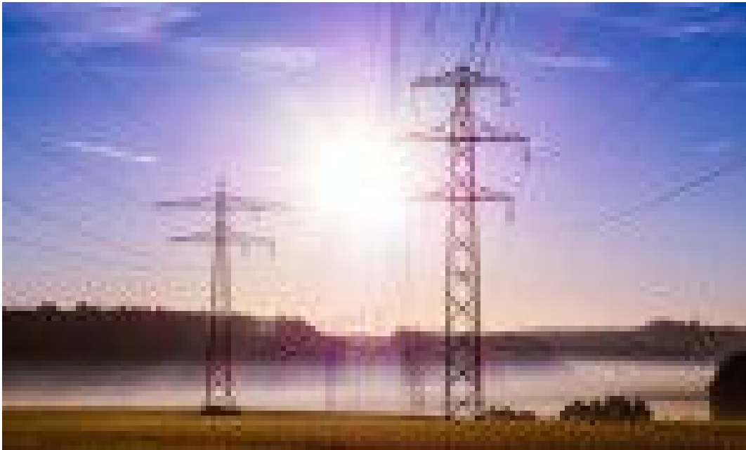
( http://www.dealstreetasia.com/stories/ifc-ema-power-invest-175-5m-in-summit-groups-power-projects-in-bangladesh-53052/ ) Bangladesh: IFC leads $175.5m investment in Summit Group's power projects ( http://www.dealstreetasia.com/stories/ifc-ema-power-invest-175-5m-in-summit-groups-power-projects-in-bangladesh-53052/ )